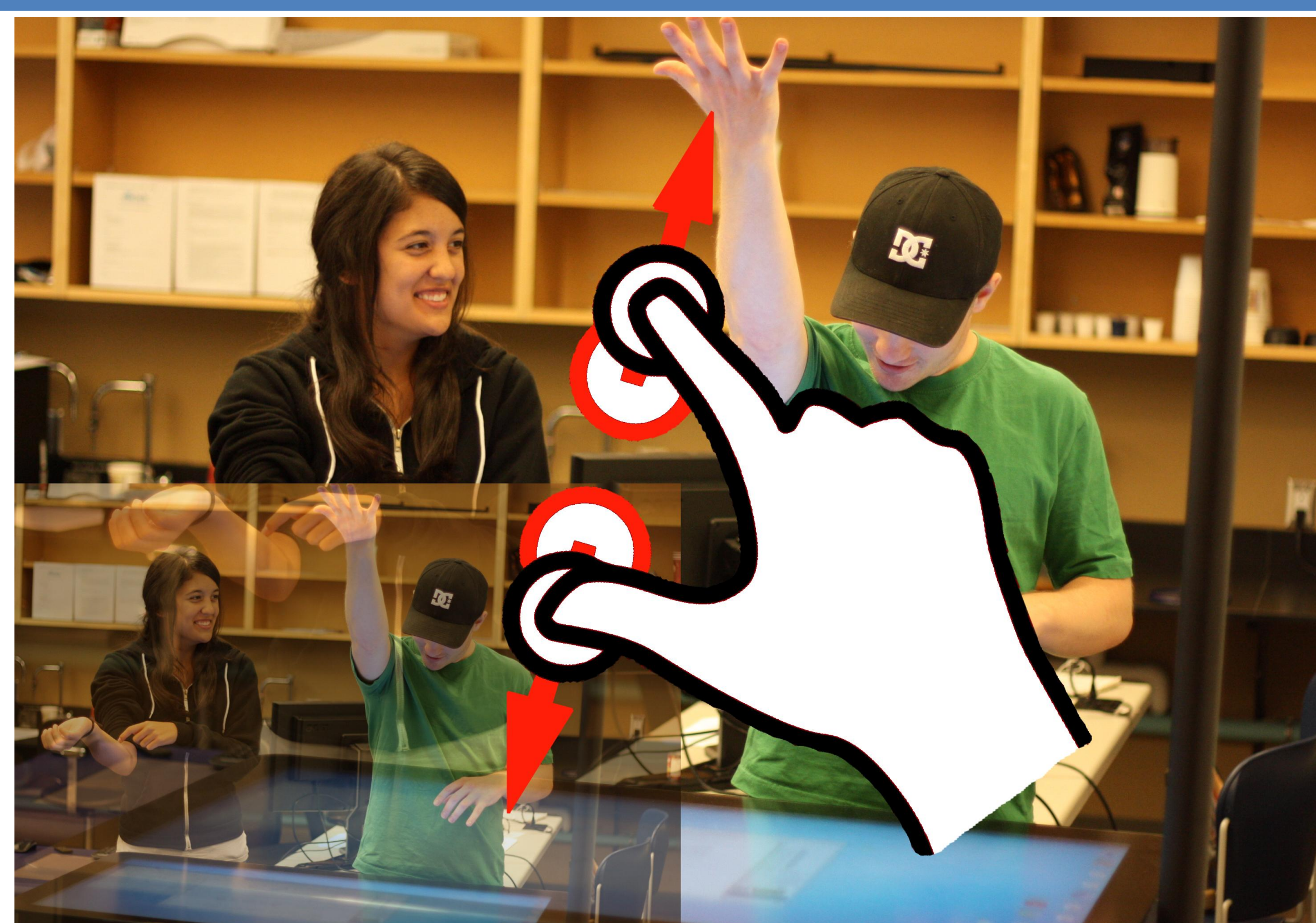
Figure 1 [6]: Scale event triggered by pinch gesture